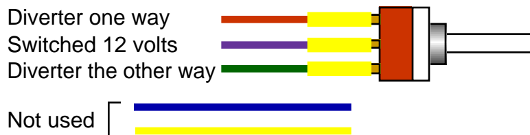
Aftermarket switch wiring without diodes.

The Power Relay works with the original wiring harness and switch that is supplied with the hydraulic diverter. It will work with aftermarket switches that have diodes built into them as well. It will also work with aftermarket switches without diodes . This is because the Banderlog Diverter Power Relay already incorporates the diodes in its design.